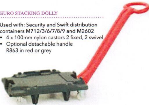
R864 & R863

Used with: Security and Swift distribution containers M712/3/6/7/8/9 and M2602 • 4 x 100mm nylon castors 2 fixed, 2 swivel • Optional detachable handle R863 in red or grey