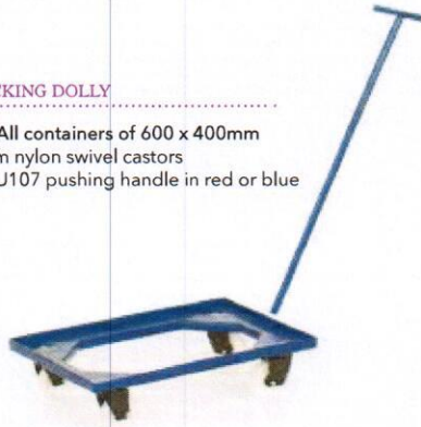
U106 & U107

Used with: All containers of 600 x 400mm • 4 x 100mm nylon swivel castors • Optional U107 pushing handle in red or blue